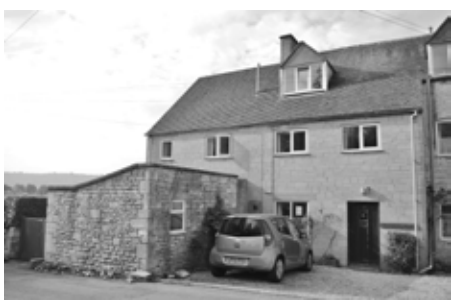
Hambutts Mynd, Edge Road. A detached house offering fine country views. There is one twin, one double and a single all en suite with a separate dinning area for guests. Off street parking is available and pets are permitted.