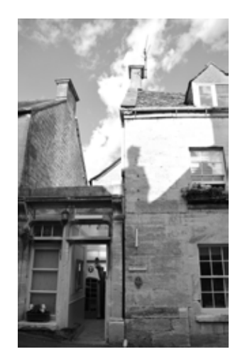
St Annes, Gloucester Street A traditional Cotswold terrace house offering two doubles and one twin again all en suite. There are separate dining and lounge areas. Wifi is available and occasionally dogs are permitted.