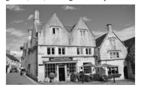
Cardynham House, The Cross. A 15th century listed building with a large range of accommodation each of the nine rooms having its own unique style. There is a residents lounge and a separate breakfast area.

Tibbiwell Lodge, Tibbiwell lane Set in a secluded position with lovely views from the balconies. It offers two doubles and one twin all en suite and a studio apartment. There is parking, a garden, wifi, and dogs are accepted.