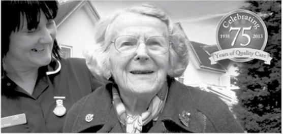
Resthaven Nursing Home Limited is a Limited Co my registered in England & Wales (No. 805664) and a Rec d Charity (No. 235354