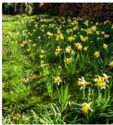
Open Garden Sheepehouse Cottage 26th March